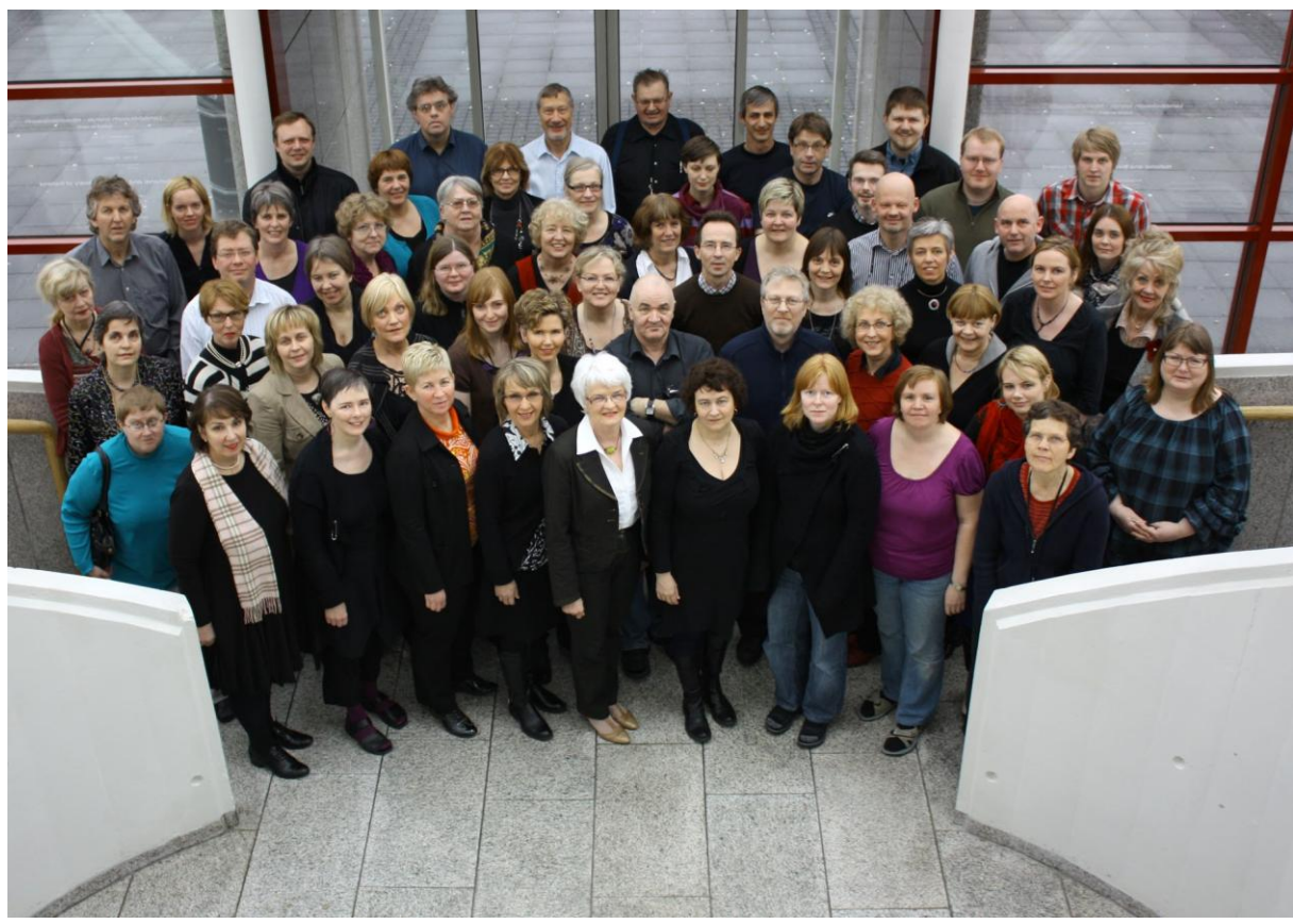
The Library staff on 6 May 2010.

National and University Library of Iceland: ANNUAL REPORT 2009.