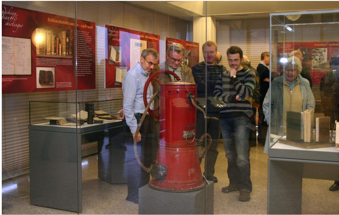
The Library's first book vacuum cleaner, which was on view in an exhibition marking the Library's 100<sup>th</sup> anniversary.