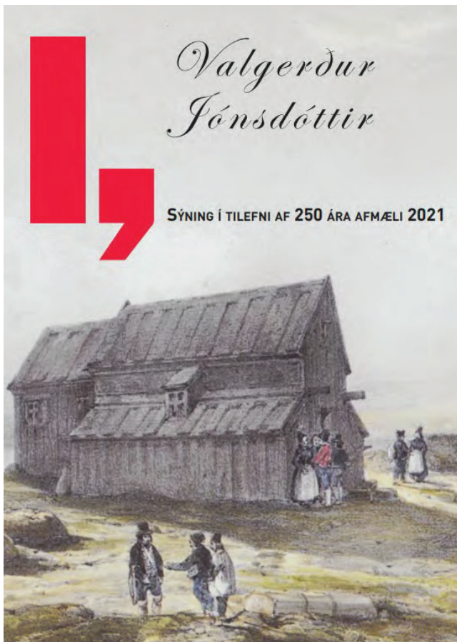
Frontpage of the exhibition catalog.