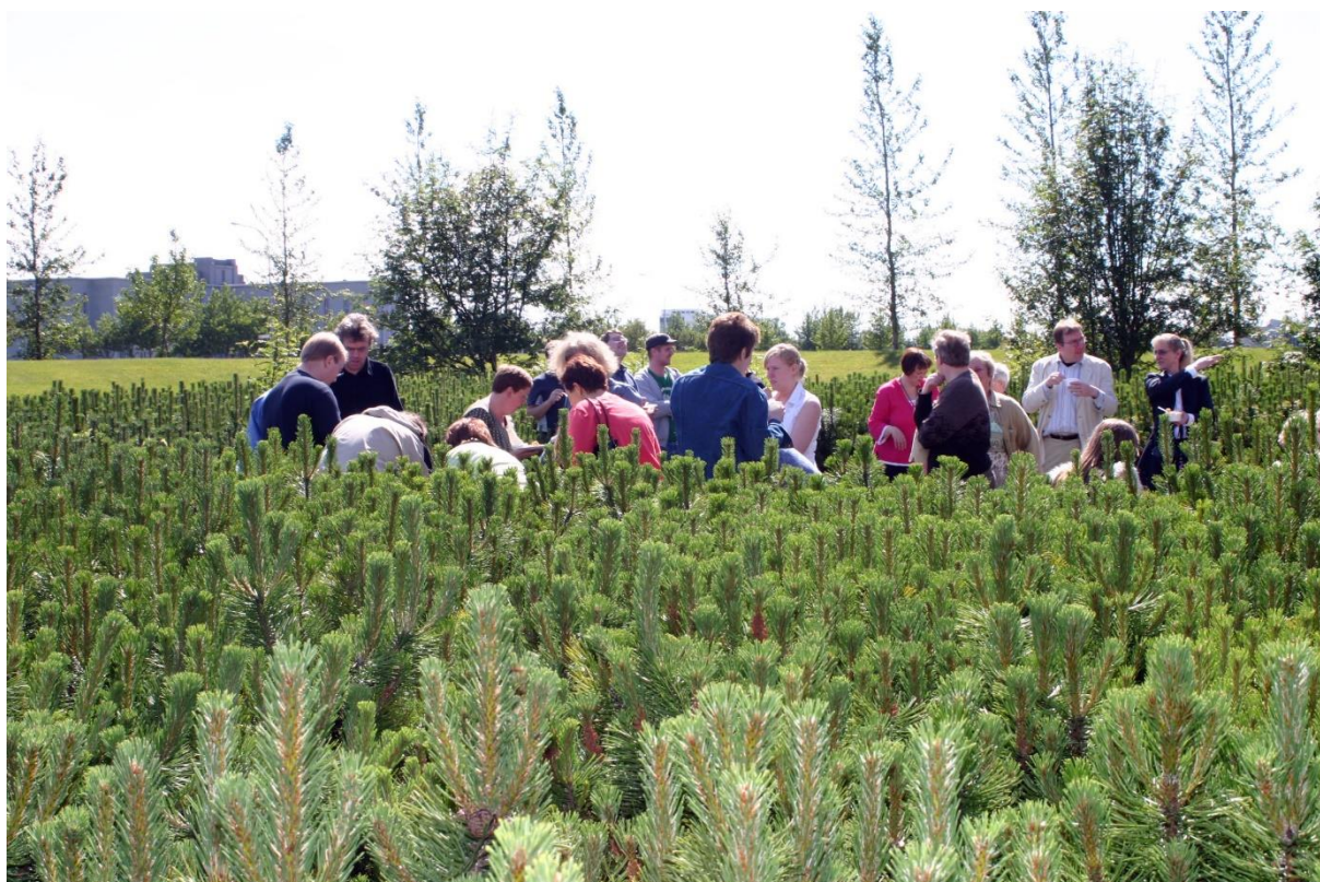
Ice cream day in the Library garden.