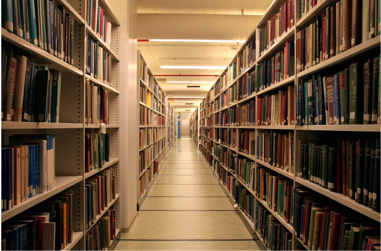
Stacks in the basement of the National Library.

National and University Library of Iceland: ANNUAL REPORT 2017.