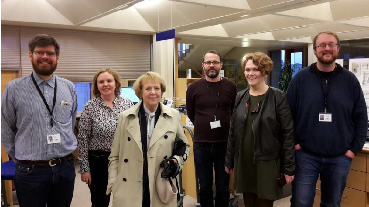
Good guest at the Library. Vigdís Finnbogadóttir former president of Iceland meets the staff in Services.

NATIONAL AND UNIVERSITY LIBRARY OF ICELAND